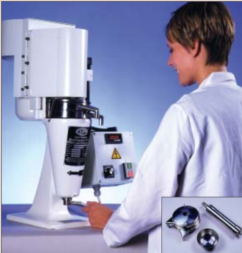
Model LE Benchtop centrifuge for lab scale separation of process volumes from 1.5 to 15 liters. Accessories are easily added or removed without need for tools, for rapid set up and clean up.

CEPA centrifuges are characterized by their ability to process many times the volume of their tubular bowl. Fluid mixtures are fed into the bottom of the rapidly rotating separating chamber. Solids are retained, while liquid components are expelled from the top of the chamber through a collection tray. For liquid-