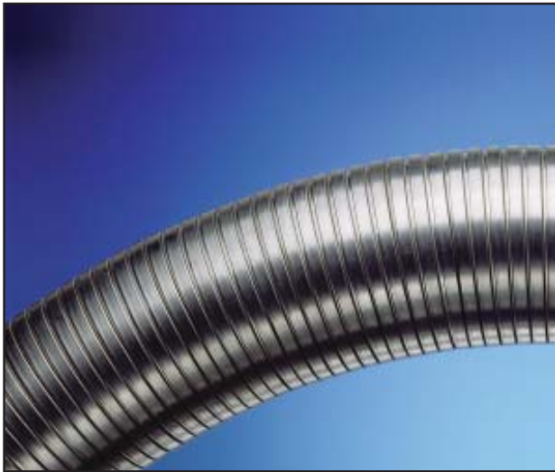
HT2000 Series Heavy Duty Stripwound Interlocked Chimney Liner

Stripwound interlocked construction provides a heavy duty flexible metal hose that offers flexibility, strength and long service life.