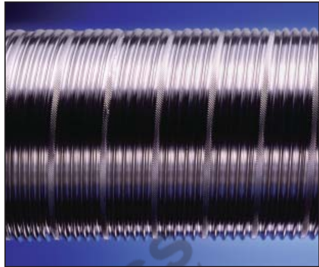
HT3000 Series Convoluted Chimney Liner

■ A single metal strip is corrugated and helically-wound to form a flexible gas-tight metal hose that offers flexibility, light weight and resistance to corrosion.