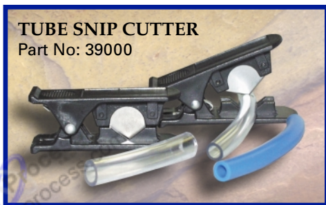
TUBE SNIP CUTTER Part No: 39000

BEV-A-LINE IV & V HT can be custom fabricated into coils, bends and angles to reduce connector problems and stress cracking of tube walls and fittings.