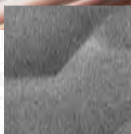
Chemfluor® Tubing Made from Standard PFA Resin Avg. Cell Size - 20 microns