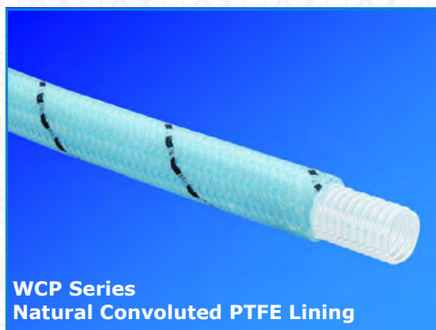
WCP Series Natural Convoluted PTFE Lining