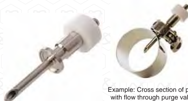
Example: Cross section of pipe with flow through purge valve

The newest release are the inline sampler with a constant flow throw purge. The liquid is pulled from the middle of the stream for sampling. The sample tube is constantly being flushed through by the moving fluid pressure and exiting a small hole on the down stream side right before the Ferrule, NPT or Weld connection to the tubing.